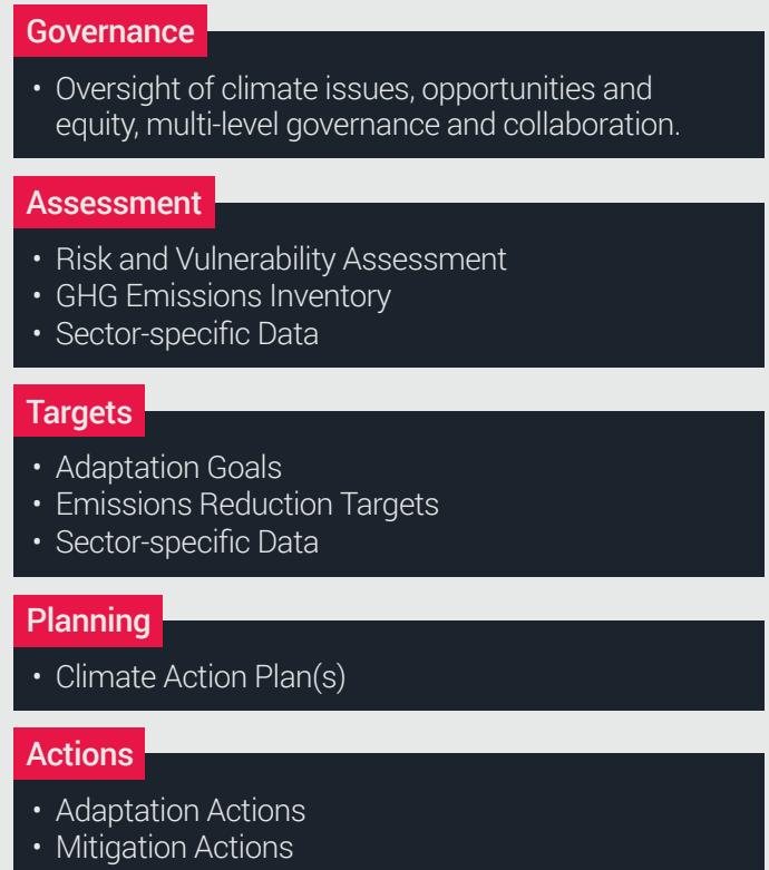
Figure 1: Questionnaire Structure

More information on Pathways is provided in the CDP Help Center .