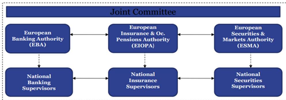
Figure 1 - XBRL implementation within the European System of Financial Supervision

The standard is managed by a not-for-profit consortium, with 700 members from around the globe, with an explicit public interest purpose to enhance the accountability and transparency of global business performance through the development of open data exchange standards in this field.